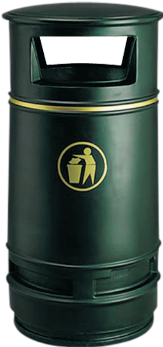
'Atlanta' type polyethylene litter bin

These litter bins are designed to combine traditional styling with all the benefits of UV Stabilised polyethylene.