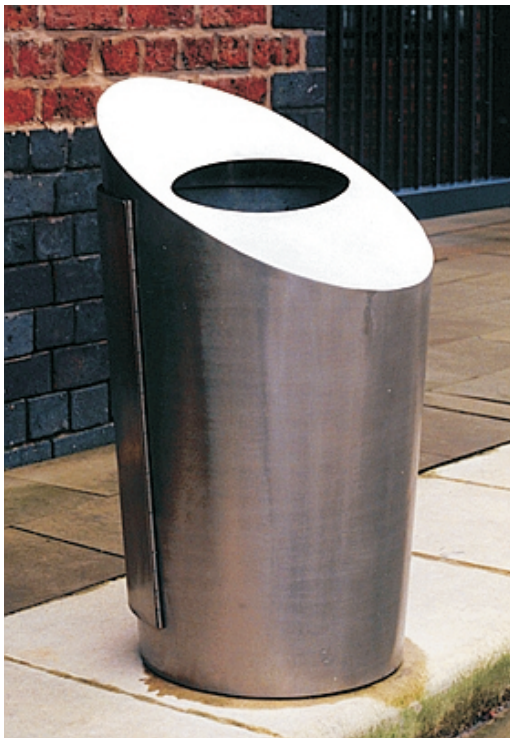
'Malmo' stainless steel litter bin

Barricade also offer timber, recycled plastic and steel litter bins.