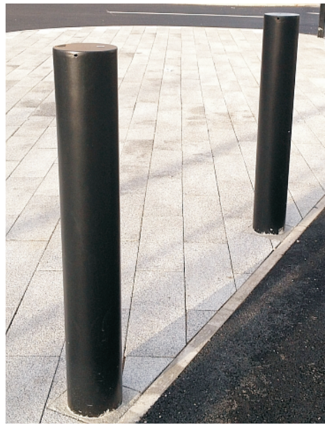
Steel bollards, finished in black.