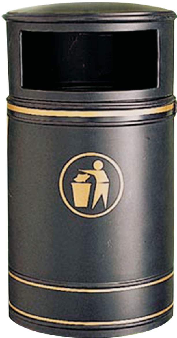
'Orlando' polyethylene litter bin

These litter bins are designed to combine traditional styling with all the benefits of UV Stabilised polyethylene.