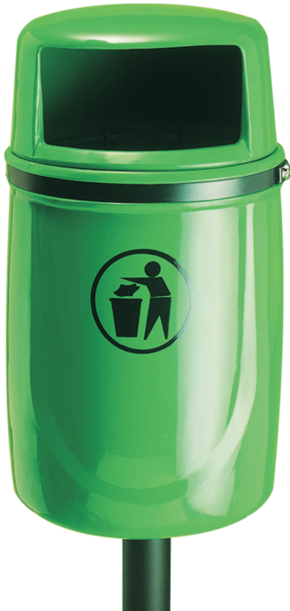
'Tampa' polyethylene litter bin

These litter bins are designed to combine traditional styling with all the benefits of UV Stabilised polyethylene.