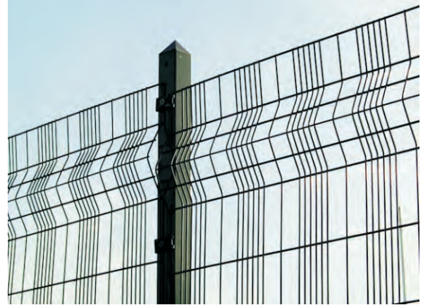
Paladin type fencing