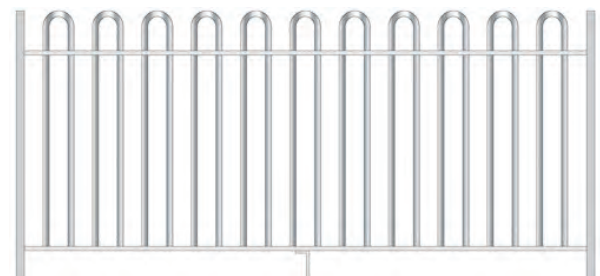
Bow top fencing.

Bow top fencing provides an aesthetically pleasing and safe means of perimeter protection. It is an ideal fixture on playgrounds or public gardens where safety is an issue, due to its rounded top.