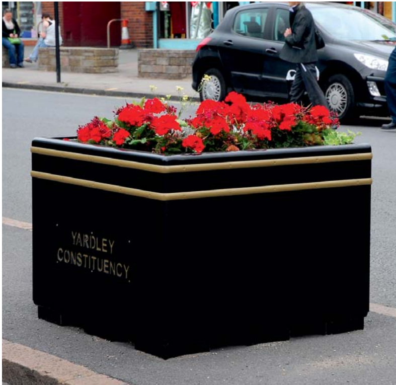
'Florence' steel planter

Our planters come in a wide range of sizes and depths, and can be used to display whichever combination of flowers or perennial plants that you so wish. Street planters offer a sturdy, attractive and practical access control solution.