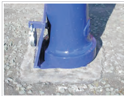
Removable Polymer Bollard