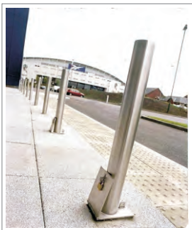
Stainless Steel Version