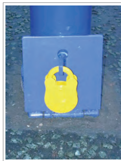
Firebrigade Lock (FB14 For outside of London)