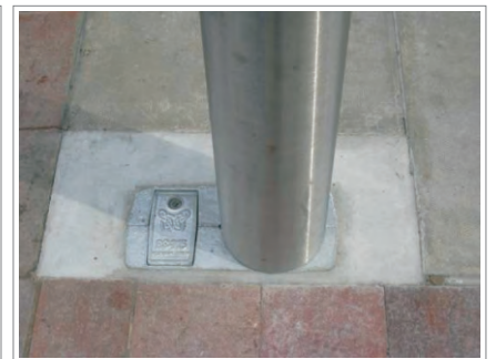
RS Flush Socket System