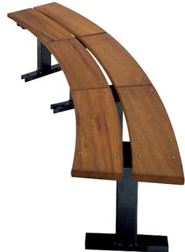
'Manila' type timber bench