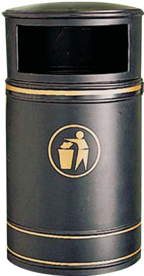
'Orlando' type polyethylene litter bin

These litter bins are designed to combine traditional styling with all the benefits of UV Stabilised polyethylene.