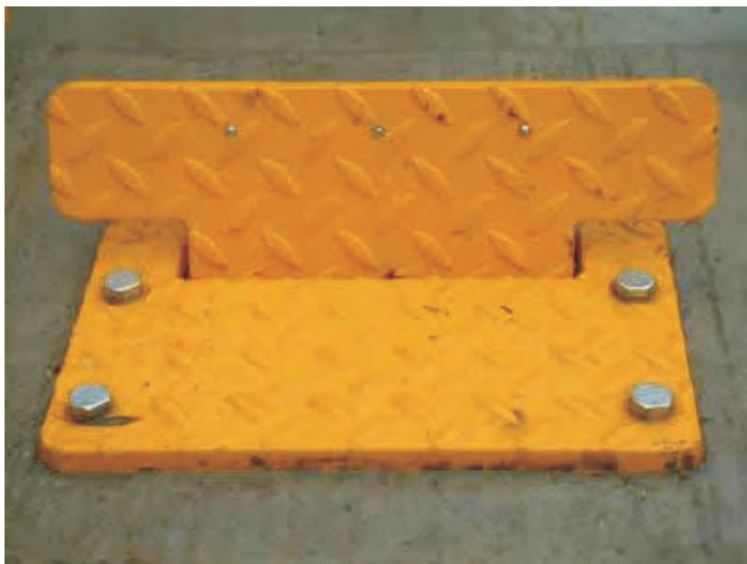
Close up of floor mounted traffic control flow plate.